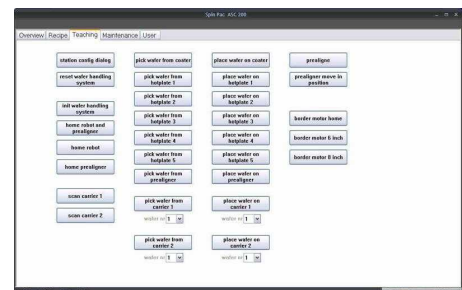
Semi conform HMI

Pac Tech GmbH Am Schlangenhorst 15-17 14641 Nauen Germany