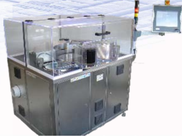
SpinPac ASC 200